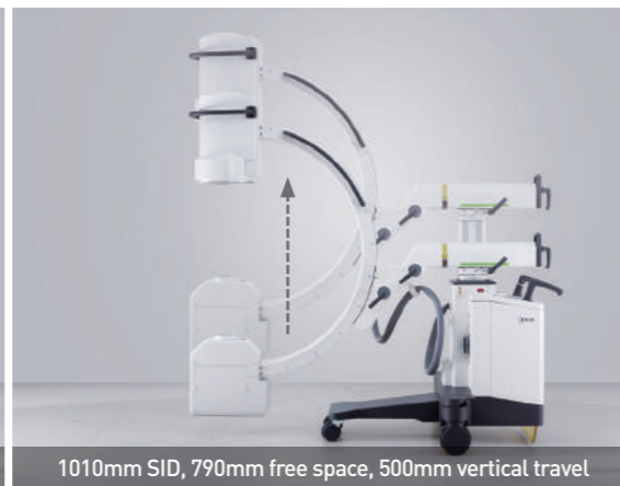
1010mm SID, 790mm free space, 500mm vertical travel