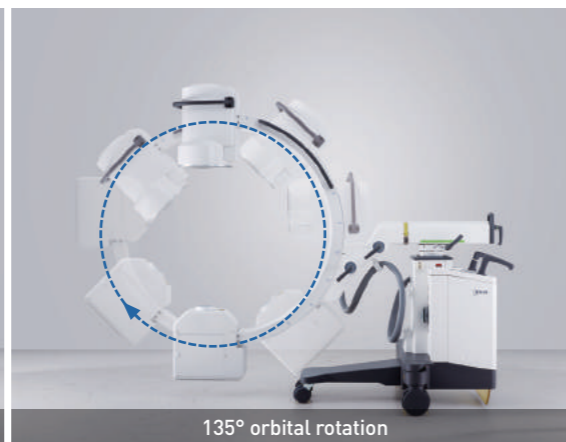
135° orbital rotation