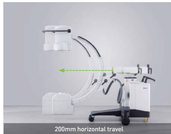
200mm horizontal travel